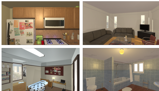
Figure 1. Examples of AI2-THOR scenes.